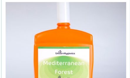
610ml Sanair refill