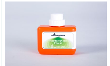
75ml Booster Sanair refill