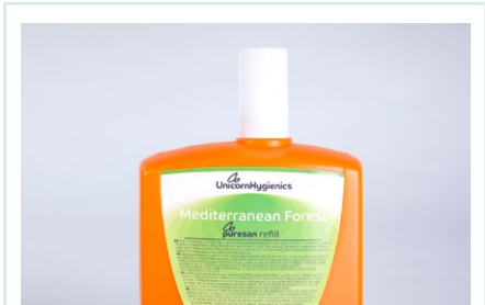
310ml Puresan refill