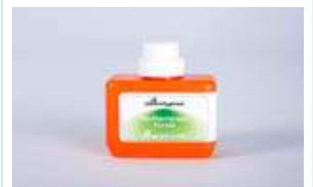
75ml Booster Sanair refill