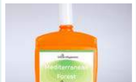
610ml Sanair refill