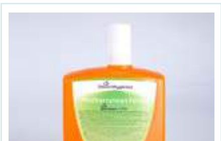
310ml Puresan refill