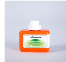
Sanair boosters 75ml

Our formulations are so carefully combined that over time, the top, middle and base notes reveal themselves to the senses.