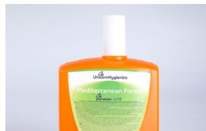
310ml Puresan refill