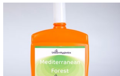
610ml Sanair refill