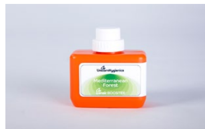
75ml Booster Sanair refill